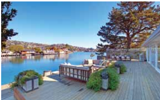
Belvedere • $4,495,000 180 San Rafael Avenue Scott Woods