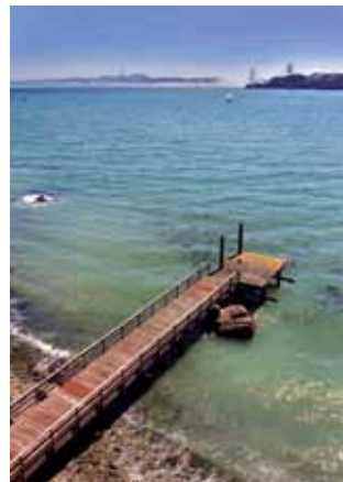
Belvedere • $4,500,000 43 Cliff Road Jennifer Dunbar